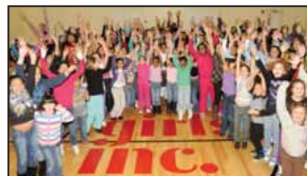
Girls Inc. of Lynn Plenty of good reasons for girls-only environment PAGES 6-7