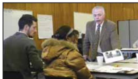
Serving People in Need Volunteers provide free tax-prep services to community members PAGE 6