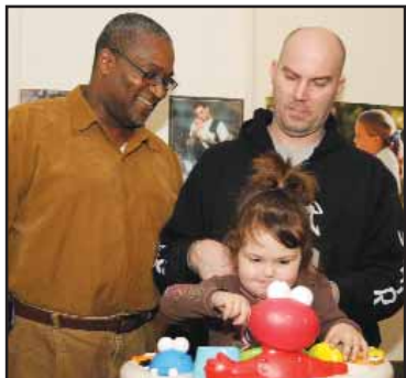
Catholic Charities North Program helps dads become better parents PAGE 4