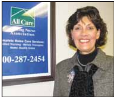
All Care VNA Committed to quality care PAGE 2