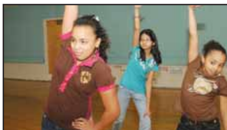
Greater Lynn YMCA Girls are having the time of their lives PAGE 5