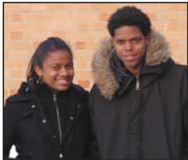
KIPP Academy Lynn Graduates continue to excel in high school PAGE 3