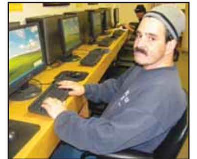
Bridgewell VIP provides hope for the homeless PAGE 11