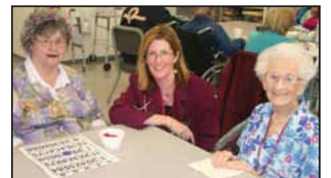
Elder Service Plan of the North Shore Is my loved one in need of assistance? PAGE 9