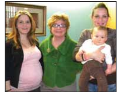
Project COPE Program helps moms stay clean and sober PAGE 12