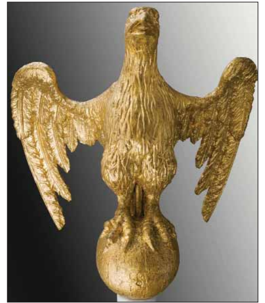
An eagle carved from gilt wood in 1804 by Samuel McIntire will be on display in Philadelphia for six months.

Established in 1897, the Lynn Museum & Historical Society is the only organization in the city devoted to collecting, preserving and fostering an appreciation of Lynn's rich history. The McIntire eagle is just one object in the museum's vast collection, which includes more than 17,000 artifacts. Among them are numerous examples of shoe-making equipment, from the smallest finishing tools to the largest machines, which celebrate Lynn's role as a major industrial center during the 19th and 20th centuries. The textile industry was also a prominent one and, today, thousands of examples of dresses, hats, shoes, jewelry and other accessories spanning 250 years can be found at the museum. In addition, the collection includes works of art from the Lynn Beach Painters, folk art, samplers, historic portraits, photographs, furniture, fine silver, clocks and other decorative art pieces.