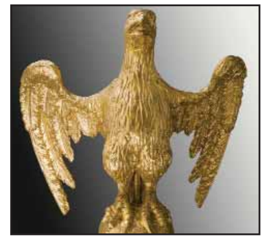
Lynn Museum & Historical Society Famed eagle soars to new heights PAGE 10